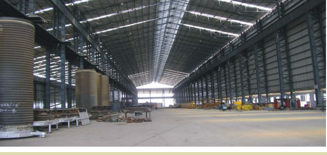
Engineering Industry GPT