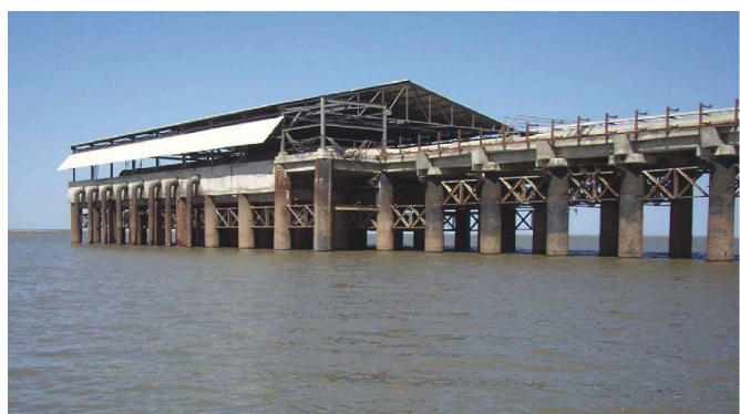
Sea Water Intake Station NIRMA LIMITED