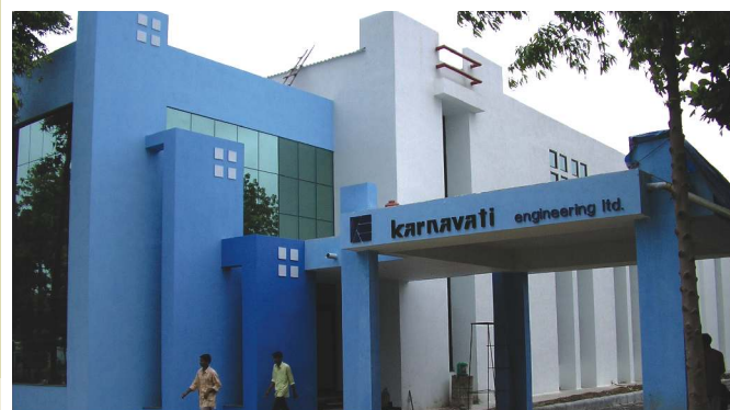
Pharmaceutical Machinery KARNAVATI ENGINEERING