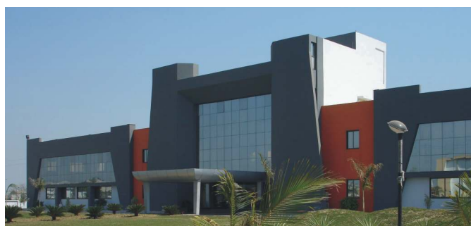
Engineering Industry-Furniture Mfg. HOUSE OF FURNITURE (HOF)