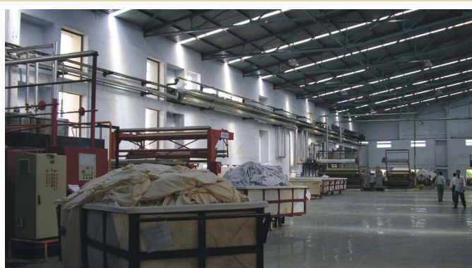
Textile Industry CREATIVE TEXTILE