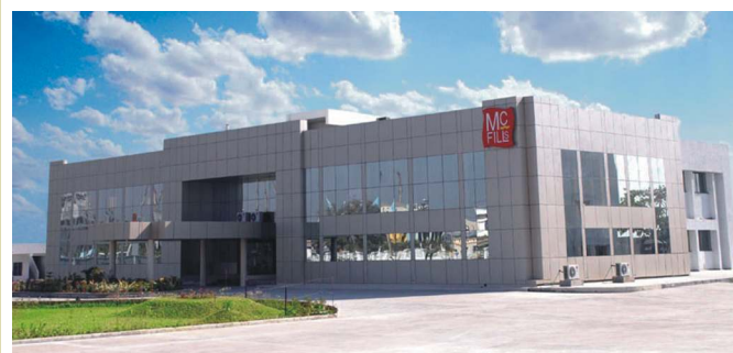
Food Industry McFILLS