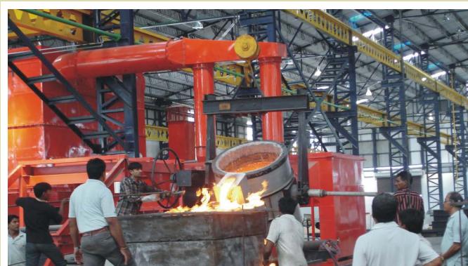
Modern Foundry JYOTI CNC AUTOMATION