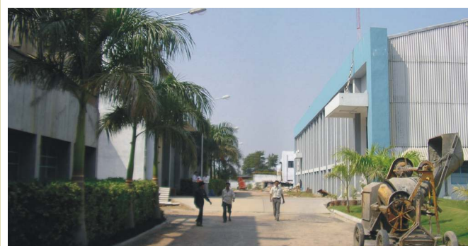
Pharma Equipments PHARMALAB PROCESS EQUIPMENTS PVT. LTD.