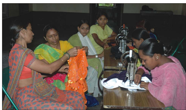
Co-sponsoring English teaching and self-reliance activities for girls and women.