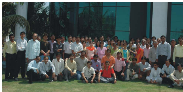
Technical Tour - Rajkot