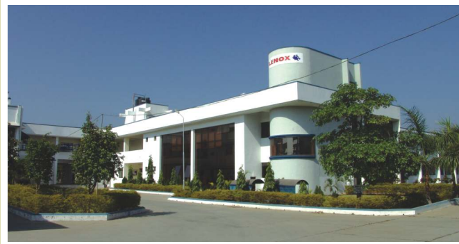
Engineering Industry LENOX (USA BASED)