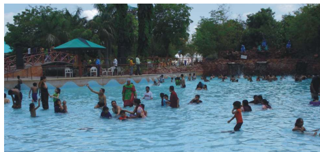
Frolicking in Water Park - Mehsana