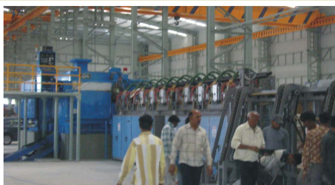
Engineering Industry ROLEX RINGS PVT. LTD.