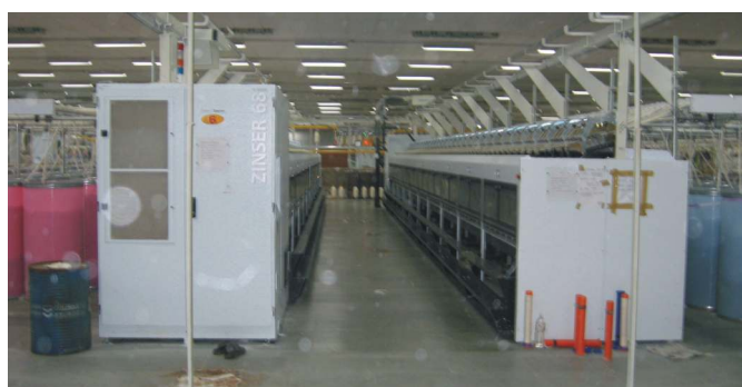
Textile Industries MAFATLAL DENIMS LTD.