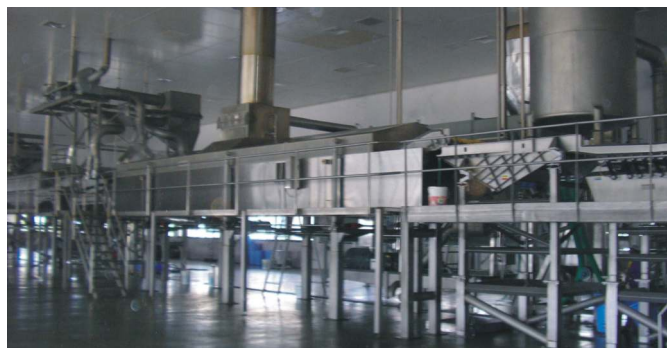
Food Industry BALAJI WAFERS PVT. LTD.